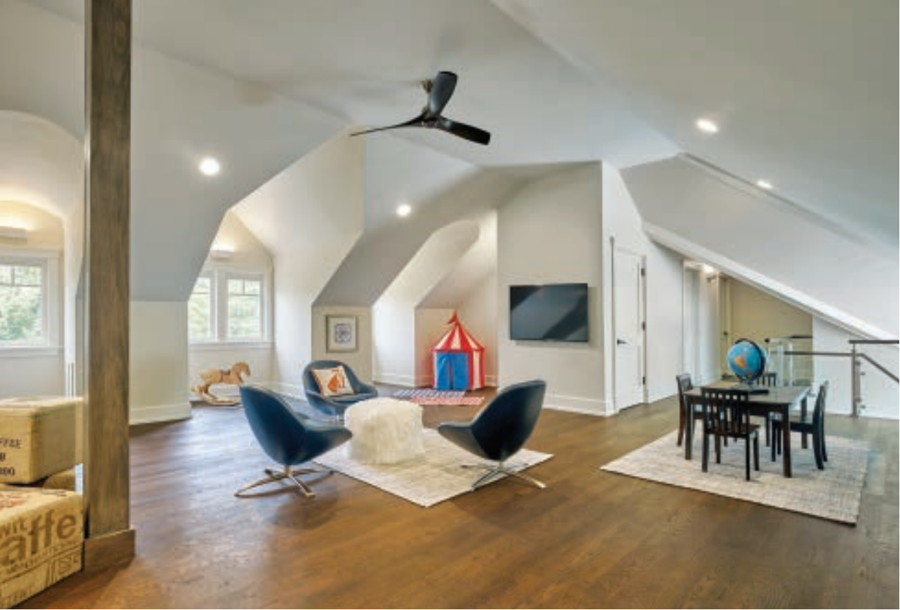
The attic, located over the three-car garage, features a study/playroom. According to Knight, "The children fell in love with the attic. This space was turned into a children's paradise."