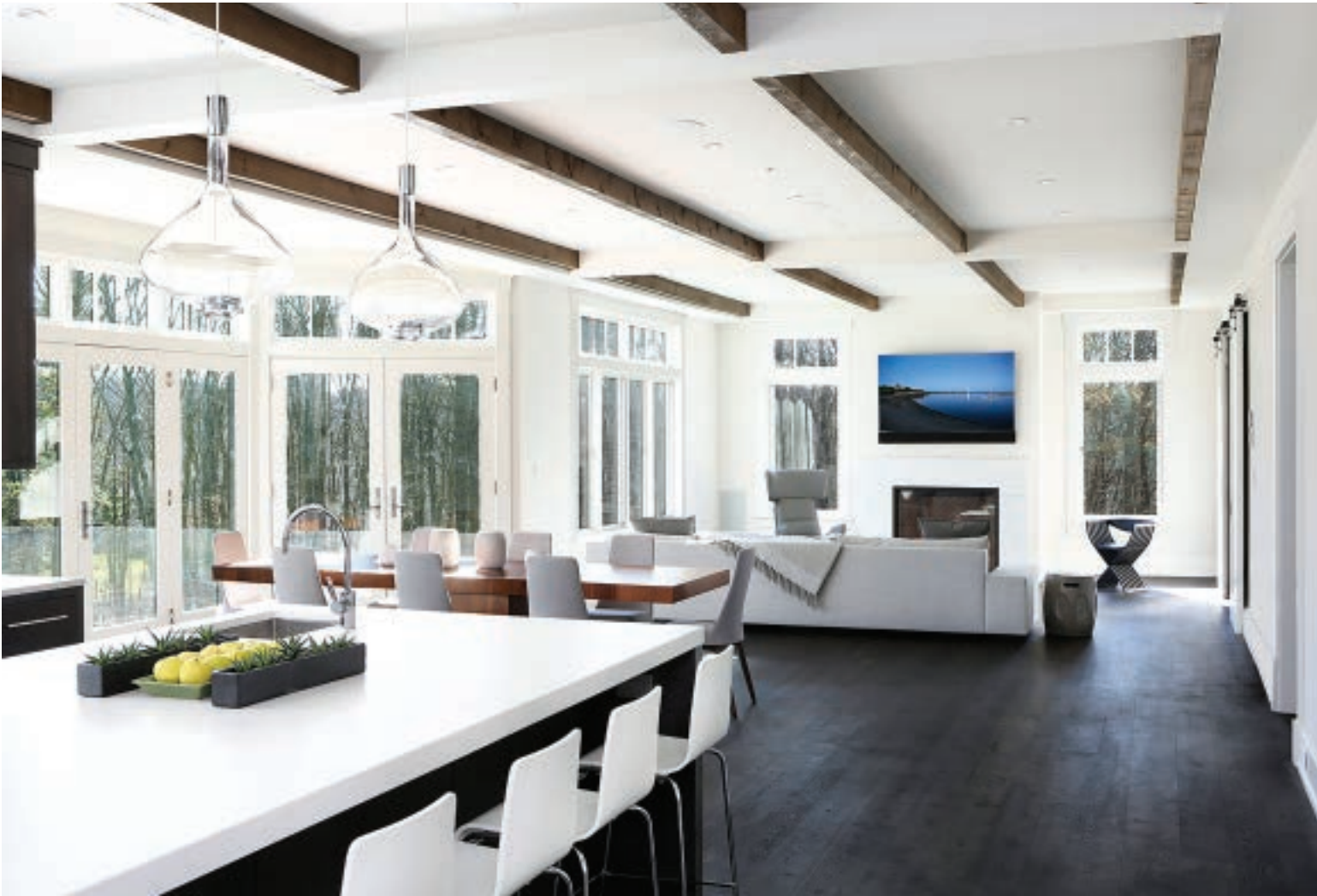
OPEN FLOOR PLAN | The open floor plan allows for sight lines across the home's main level. KITCHEN | The kitchen, which Knight calls "Modern Alfresco," is "designed for serious cooks with two dishwashers, two sinks, a six-burner range with a griddle, a butler's pantry and a food pantry."