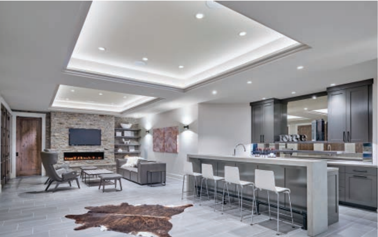
Tray ceilings in the basement entertainment area create a visual break in the long space.

DNJ: How did you maximize the flow from indoors to outdoors? KNIGHT: Taking advantage of the sloping site, we were able to open the home to grade on the first level at the front of the house and at the basement level at the back of the house. The kitchen, which serves as a gath-