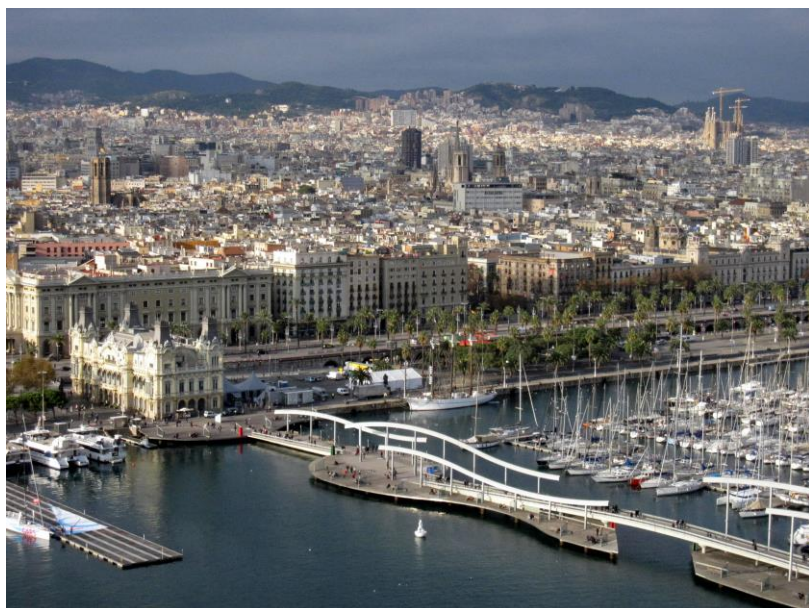
Barcelona, with Antoni Gaudi's Sagrada Familia cathedral (far right), under construction since 1882