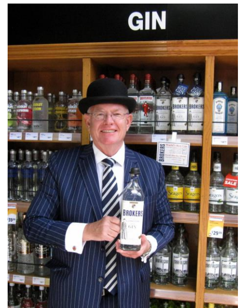
Broker's Gin has pride of place on the shelves