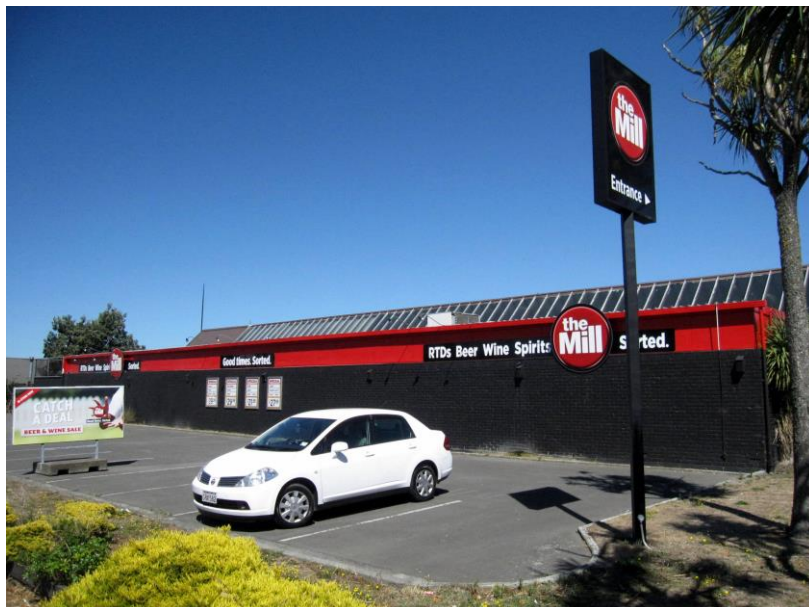
One of the Mill liquor stores in Christchurch