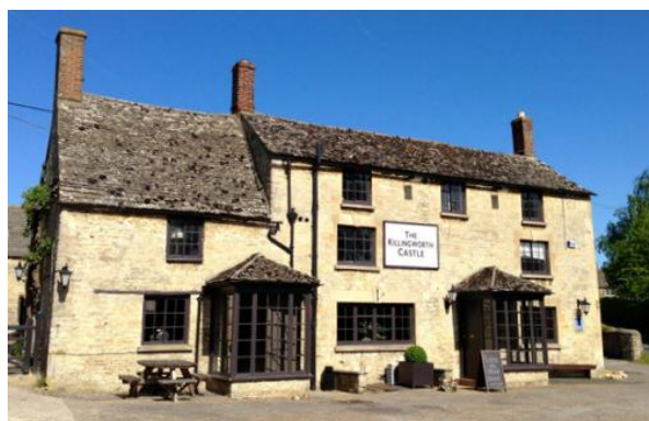
The Ebrington Arms in Ebrington and The Killingworth Castle in Wootton, both of which serve Broker's Gin from a revolving optic stand

Another great new account for Broker's Gin is Ronnie Scott's Jazz Club, which has been the most famous jazz club in London for over half a century. Broker's is now the house pour and there are four cocktail listings too. This is one of many new placements made by our UK distributor, Hi-Spirits. Well done and thank you.