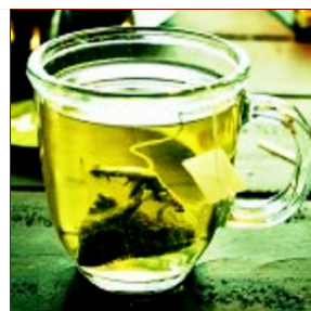
The Tea That's 10 Times Better Than Green Tea