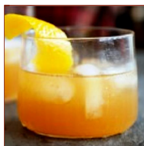
The Only Cocktail You Need This Fall