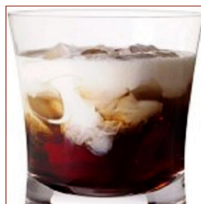
Mixers You Should Absolutely Never Use