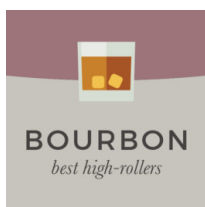
The Best High-Roller Bourbon