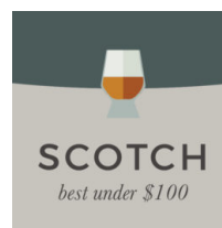
The Best Scotch Under $100