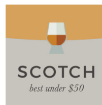
The Best Scotch Under $50