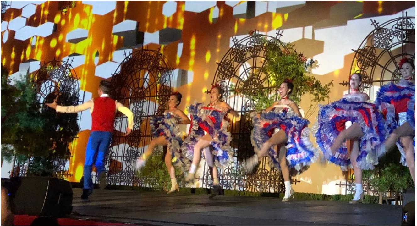
Dancers perform at the 2019 DAOU Annual Gala themed "Moulin Rouge."

Talented musicians and highly skilled professional dancers provided all manner of a French cabaret entertainment. Incredible add-ons included a candy colored merry-go-round, contortionists, and for those in need of channeling their inner toddler, a dreamy adult-sized bouncer.