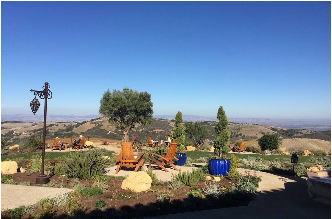
DAOU wine tasters enjoy the views and the wines.

It is best to make a reservation to visit DAOU Vineyards & Winery. Call (805) 226-5460 or visit https://www.daouvineyards.com .