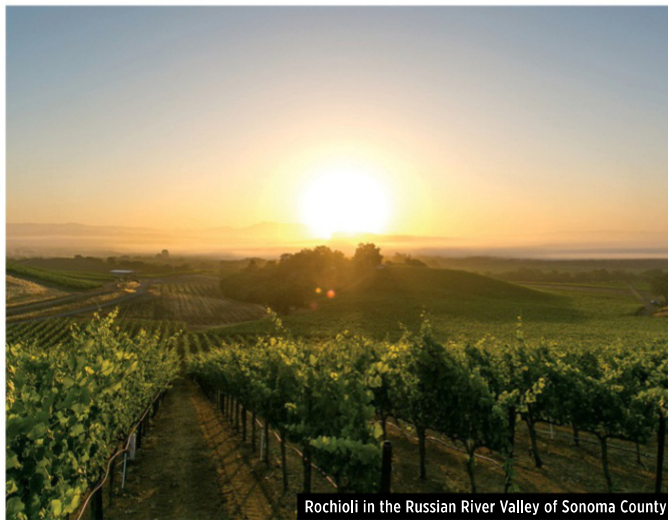
Rochioli in the Russian River Valley of Sonoma County

Russian River Valley is the cradle of modern California Pinot Noir, with the AVA's Joseph Swan and Williams Selyem wineries among the early demonstrators of what Pinot could do in the Golden State. Warm days and cool nights make for nearly ideal growing conditions north and south of the river, with many of the best sites set on gently rolling terrain rich with the coveted soil complex called the Goldridge Formation, a sand- and loam-based strata.