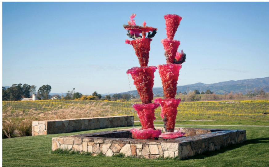
Donum contributed a classic-scoring Pinot Noir from its Winside Vineyard in Russian River Valley, north of the producer's Carneros winery, where the estate vineyards are punctuated by an extensive collection of contemporary sculpture.

The following Sonoma quartet scored 94 points. In the powerfully ripe style is the Argot Sonoma Mountain Estate Vineyard 2016 ($75); firm and elegant is the Hirsch Sonoma Coast Block 8 2016 ($95); Kerr Sonoma Coast 2016 ($65) is opulent, rich and plush; and the Rochioli Russian River Valley Little Hill 2017 ($86) offers a pure and mineral profile.