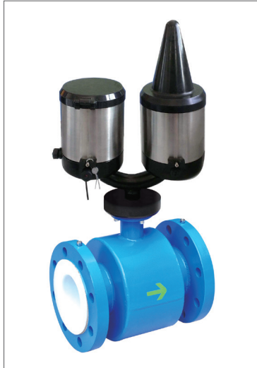
Integral type with GPRS Wireless