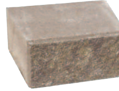
6" Veranda Large Only Cube Part# VWL