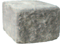
Part #VWK Combined Cube