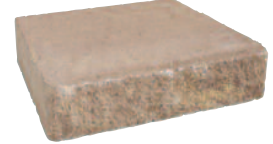
Veranda Wall Cap Part# VWC