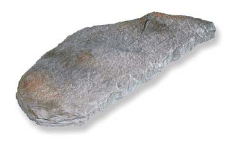
Step F - 5'I \times I'6"d

Rockport™ is a trademark of Ideal Concrete Block Company, Inc.