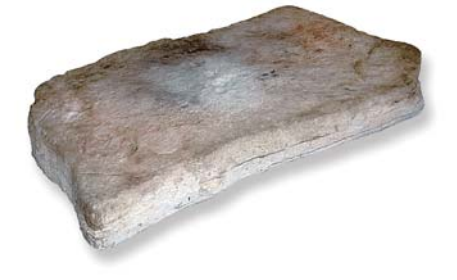
Step C - 4'1 x 1'6" d