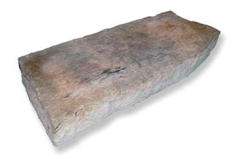
Step A - 3'6"l x 1'6"d

As Rockport Steps are asymmetrical, dimensions and weights are approximate. Dimensions are based on the largest measure of each side.