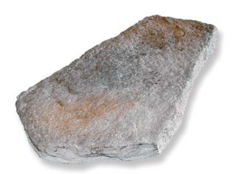
Step D - 4'6" I \times 2'd