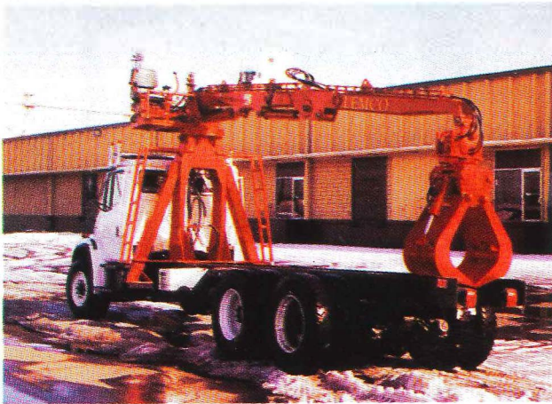
LEMCO Model 7000 - Full continuous swing loader with fully continuous swing, butt-type grapple.

Figures in the chart represent maximum actual lifting capacity controlled by unit stability and condition of loading site.