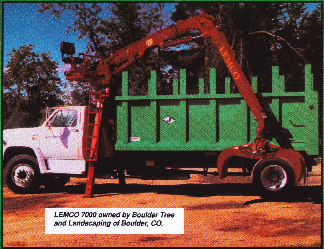
LEMCO 7000 owned by Boulder Tree and Landscaping of Boulder, CO.