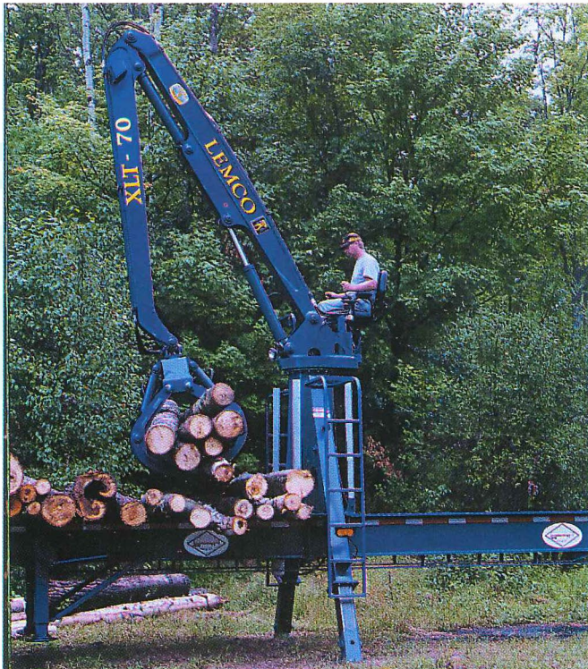
LEMCO Model XLT 70 Full continuous swing loader.

Figures in the chart represent maximum actual lifting capacity controlled by unit stability and condition of loading site.