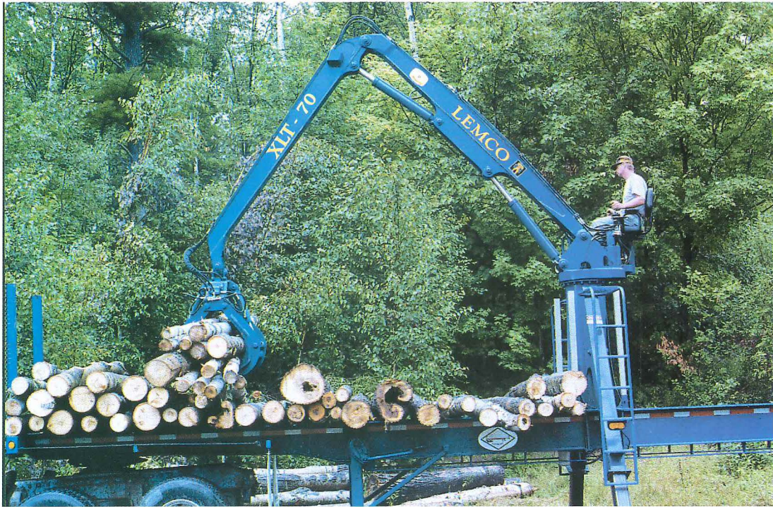
LEMCO Model XLT 70 Owned by Steve Villebro Of Hill City, Minnesota

The Model XLT 70 Loader with 4,000 Lbs. Net Weight. (Includes The Weight Of A Standard Grapple)