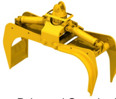
Bypass Pulpwood Grapple shown with 360° Indexator Rotator

We offer a wide variety of attachments including: