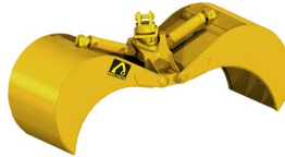
Municipal Waste Grapple shown with 280° Rotator