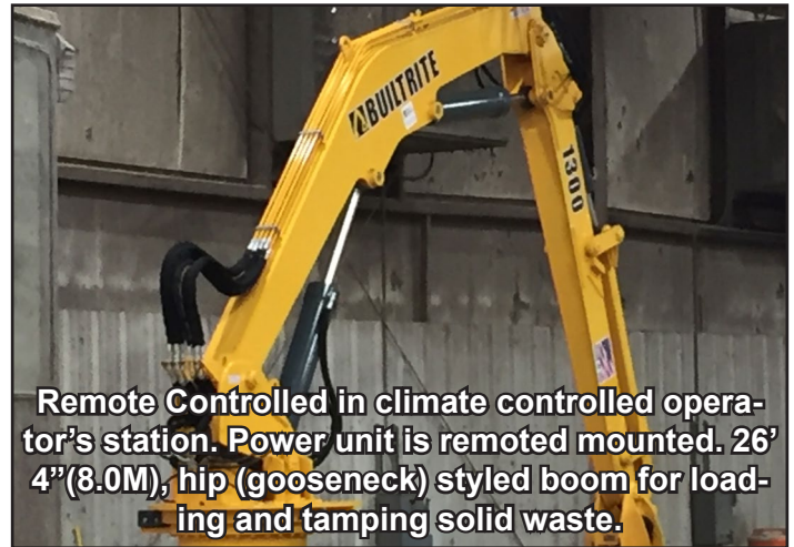
Remote Controlled in climate controlled operator's station. Power unit is remotely mounted. 26'4" (8.0M), hip (gooseneck) styled boom for loading and tamping solid waste.