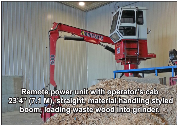
Remote power unit with operator's cab 23'4" (7.1 M), straight, material handling styled boom, loading waste wood into grinder.

Builtrite™, Stationary Electric Material Handlers have proven themselves in a number of waste and scrap handling applications, capable of handling a wide variety of materials. With a wide array of options, boom configurations and attachments available, let Builtrite design a material handler to maximize production at your facility. Stationary Electric Material Handlers are much less expensive to operate, safer, quieter and don't produce emissions like diesel powered, mobile equipment. Maintenance costs are also less and the power unit can be remotely located where it is not subjected to dusty conditions, further reducing maintenance costs.