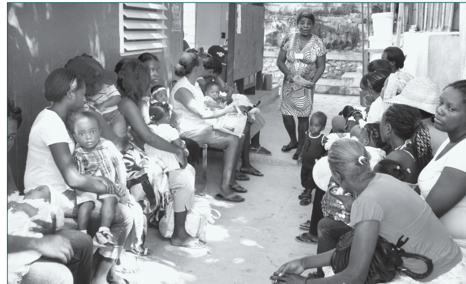
A staff member at Sr. Ann Weller Clinic (standing at center) speaks to mothers about health risks to their children.

St. Mark's twinning connection with Haiti through Notre Dame de Lourdes has been uniquely valuable as a church project, bringing together two very different cultures that communicate through love, mutual respect and the celebration of the Mass. We share in the one Eucharist, pray in unity with one another and touch one another's lives in deep and lasting ways.