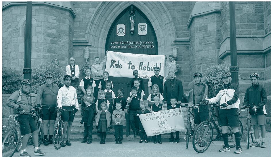
Day four of the 2016 ride stopped at Norwich Cathedral for Bishop Cote's blessing.

Solar power is clearly a great power source for Haiti. With the intensity of the