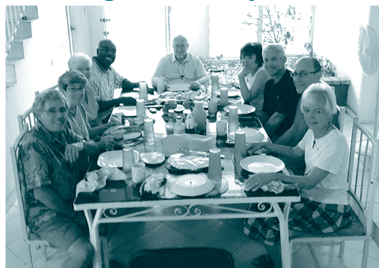
Visitors share a meal at the Mission House.

"There truly are many sides to Haiti, and I was most touched by the hope I saw visiting PeaceCYCLE. While most all are familiar with the hunger and poverty of Haiti, PeaceCYCLE models a way to not only recycle but also provide jobs that bring dignity and a sense of community. You could see the pride on the faces of the workers as we toured their operation. It gave me hope for Haiti, a small yet powerful way to combat poverty and recycle at the same time."